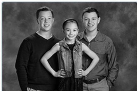
BLUE, GREY, DENIM

© Bobbie Bush Photography • Clothing Inspiration Guide • www.bobbiebush.com