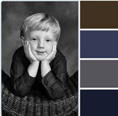
DENIM BLUE & BROWN

Clothing Inspiration Guide • www.bobbiebush.com