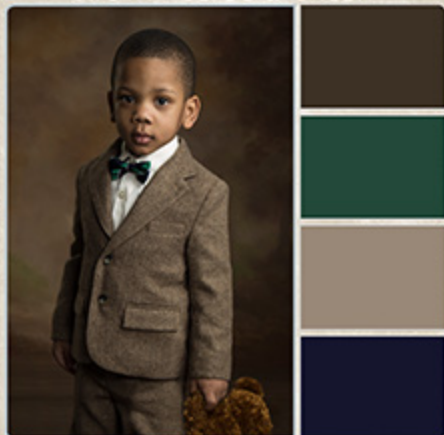
BROWN, BEIGE & GREEN