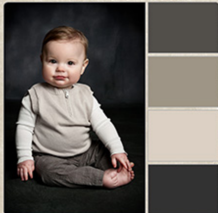
TAN, BROWN & CHARCOAL