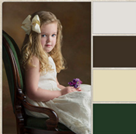
CREAMS & WHITES