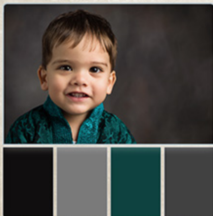
EMERALD & BLACK