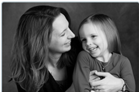
PURPLE & BLACK

Bobbie Bush Photography • Clothing Inspiration Guide • www.bobbiebush.com